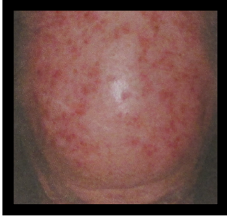
(Scalp) 5% cream

*Efudex (Fluorouracil), Aldara or Zyclara (Imiquimod), Carac or Picato