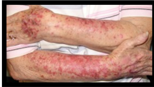
(Forearms & hands) 5% cream